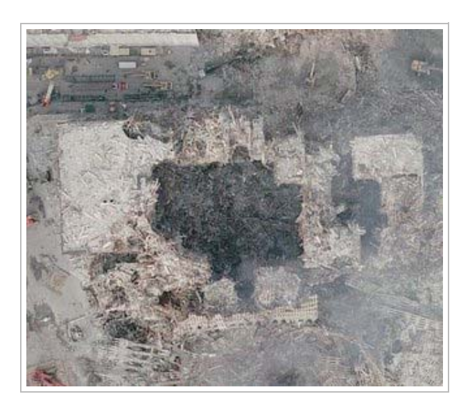
Aerial view of the WTC 6 after 9/11.

PO: It did remind me of just that. I had seen something on a Las Vegas casino being demolished and that's what it reminded me of.